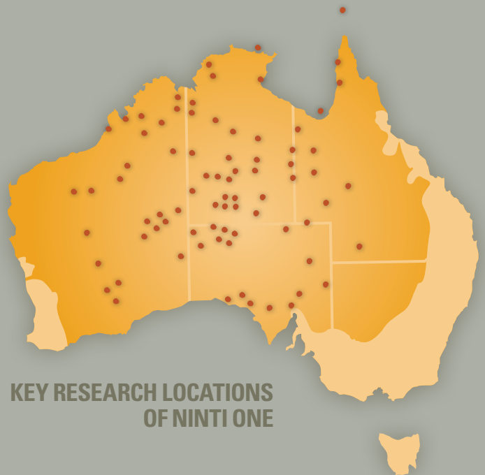
KEY RESEARCH LOCATIONS OF NINTI ONE

Australia has a rich and incredibly complex Aboriginal and Torres Strait Islander culture. The language tapestry alone is vast with up to 150 different languages commonly spoken over an area spanning more than one million square kilometres.